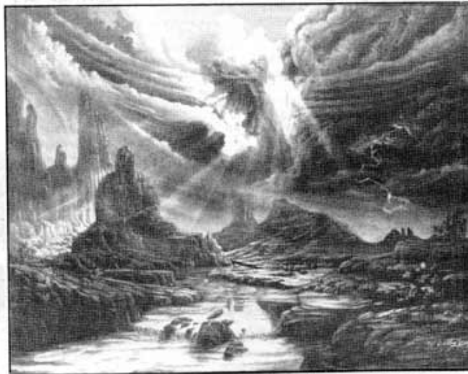
Spirits of the Waters Flow Freely

"The only space available was a little room off one of the galleries. The artist was glad to have me take it off his hands—I bought it and closed in the patio, built the interior walls, painted it...."