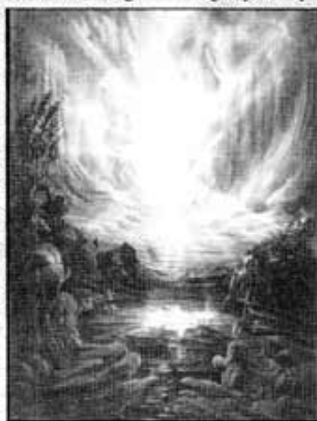
Stand at the Center

A feeling of gentleness envelops you as you enter Bearcloud Gallery , tucked away upstairs in a back corner of Tlaquepaque. This is a working gallery; if you time it right, you may catch the artist at work.